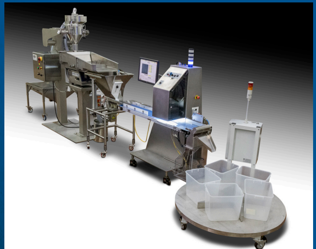
Typical installation shown with inspection and packaging equipment featuring VAC-U-MAX Gel Cap Conveyor

VAC-U-MAX Gel Cap & Capsule Conveying System provides gentle and damage-free vacuum transfer of product to counting, polishing, inspection, weighing, filling, and packaging stations. System utilizes a continuous-duty direct-drive vacuum producer — no compressed-air required with UL and C-UL certified NEMA 4/12 or NEMA 4X programmable control panel.